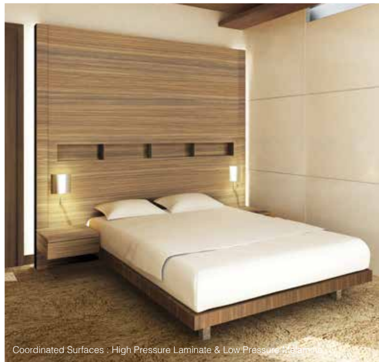
Coordinated Surfaces : High Pressure Laminate & Low Pressure Melamine