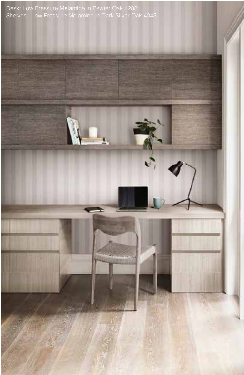
Desk: Low Pressure Melamine in Pewter Oak 4288; Shelves : Low Pressure Melamine in Dark Silver Oak 4043