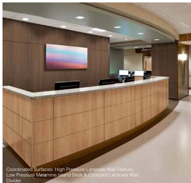
Coordinated Surfaces: High Pressure Laminate Wall Feature, Low Pressure Melamine Island Desk & Compact Laminate Wall Divider