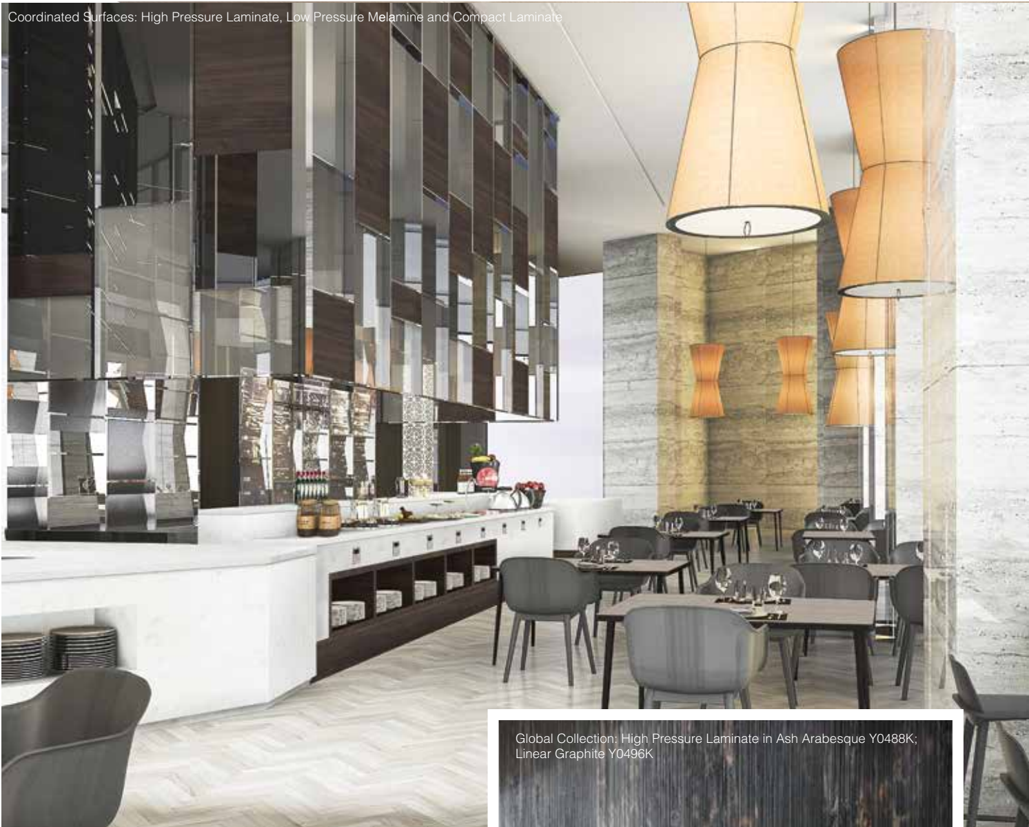
Global Collection: High Pressure Laminate in Ash Arabesque Y0488K; Linear Graphite Y0496K

Coordinated Surfaces: High Pressure Laminate, Low Pressure Melamine and Compact Laminate