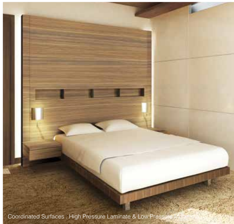
Coordinated Surfaces : High Pressure Laminate & Low Pressure Melamine