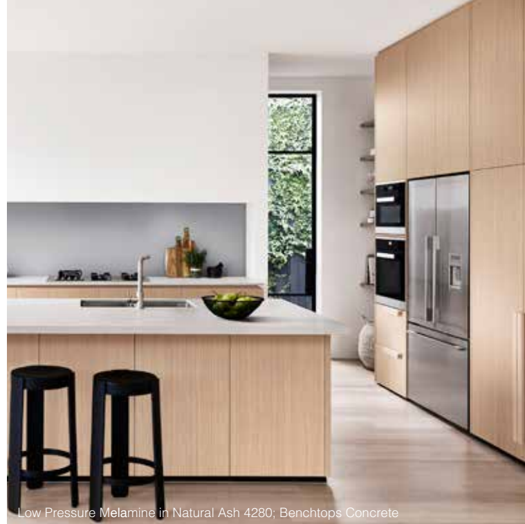
Low Pressure Melamine in Natural Ash 4280; Benchtops Concrete

Both HPL and LPM are suitable for use in cabinetry, while compact laminate may be too bulky for this particular application. HPL and LPM can be specified for all cabinetry components including shelves, backboards, and doors, although designers should use their discretion when selecting a laminate for shelves: